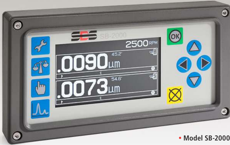
• Model SB-2000